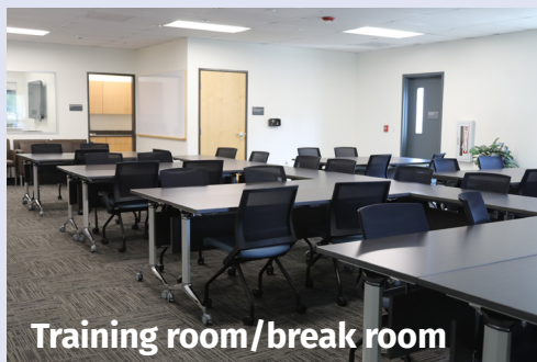
Training room/break room

Admire Landscape Services' vibrant yellow marigolds and blue lobelia, our UC colors, planted for Move-In, on Big Springs Rd.