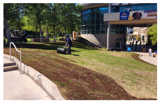
Turf grass renovation at the HUB

he Landscape Services team added native plants, trees, and cobblestone to Lot 1. The new garden requires 58% less water and supports UCR's designation as a Bee Friendly campus.